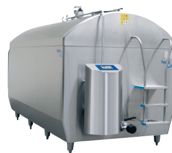
Cooling tank with integrated ice builder