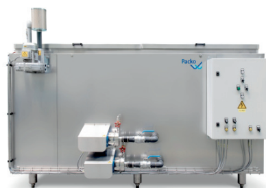
Packo ice builder for ice water production of 0.5-1°C